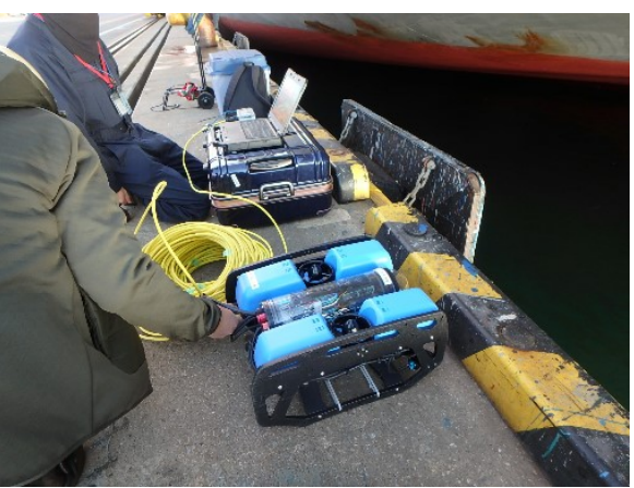
(Right) Underwater Drone(Left) Trial inspection of Aerial Drone in a cargo hold

Please refer to the link below for a closeup video captured by aerial drone. (URL) <a href="https://www.youtube.com/watch?v=bi2LkC-C1Og">https://www.youtube.com/watch?v=bi2LkC-C1Og</a>