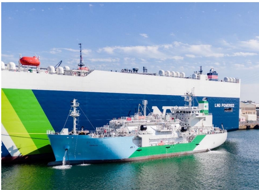
“ Kaguya ” supplying LNG fuel

“K” Line Group sets safety, environment and quality as key management issues and is working towards reducing GHG emissions based on its long-term environmental policy "Environmental Vision 2050" (Note 4). By expanding LNG-fueled vessels with LNG fuel bunkering business, we will contribute to the reduction of environmental burdens.