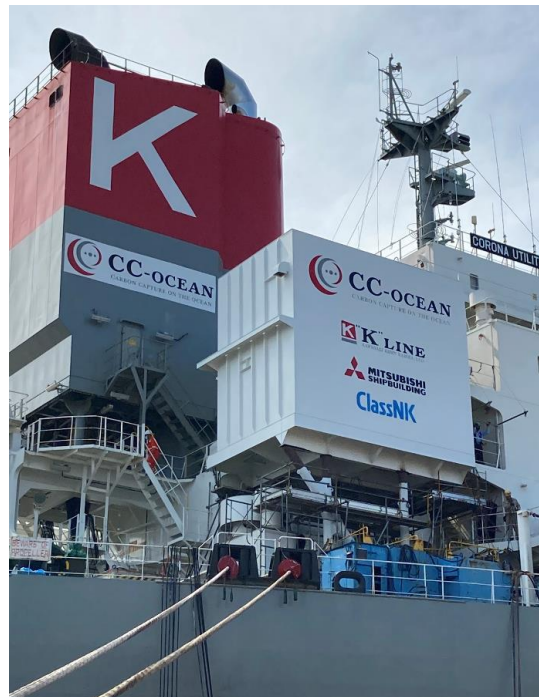
4. Installing on vessel ②