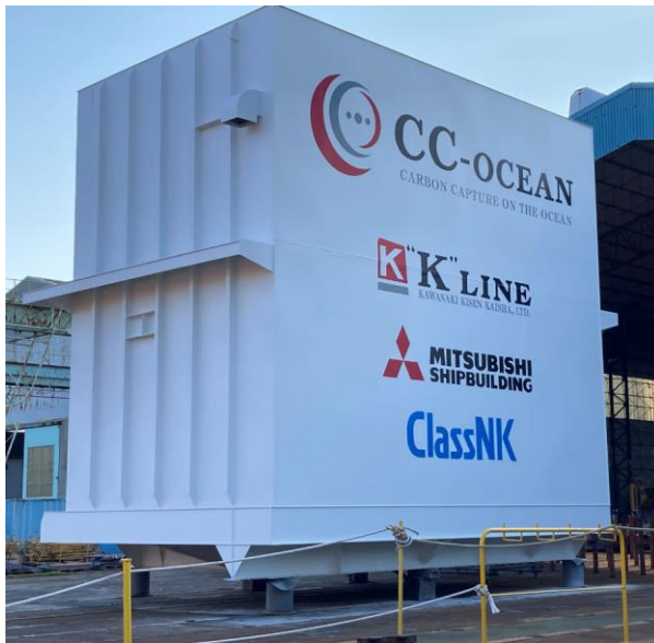
1. Before installation